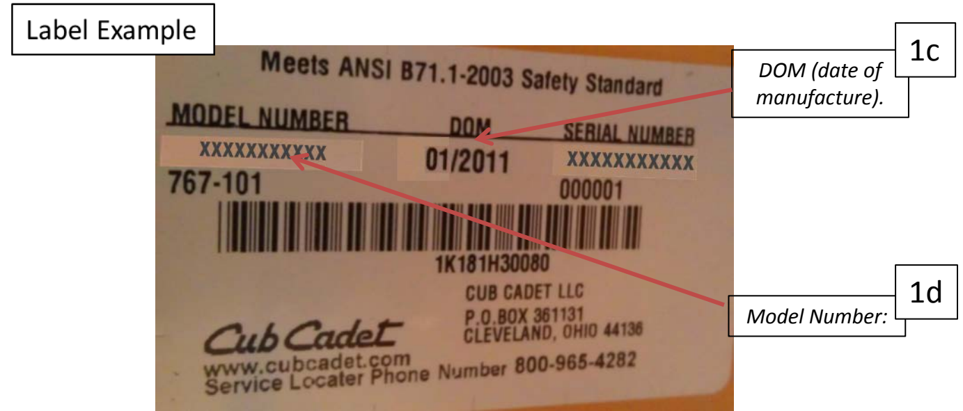
(Located under seat)