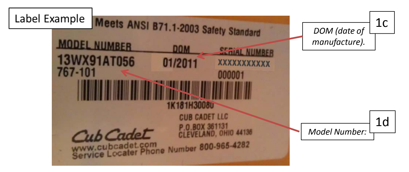
Located under seat